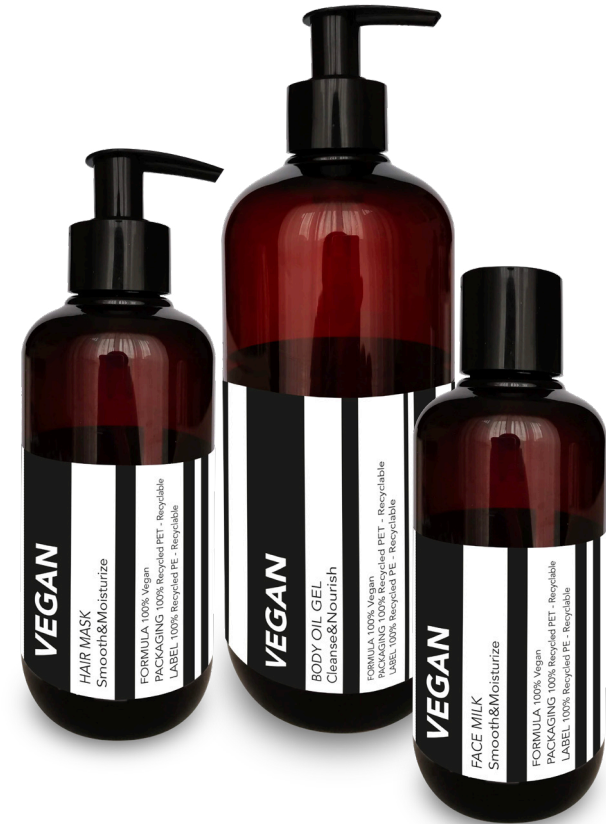
Proposal pack n.2