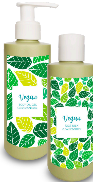
Proposal pack n.1

CLEANSING MILK CLEANSING OIL GEL SCRUB MILK SHAMPOO HAIR MASK INTIMATE SOAP